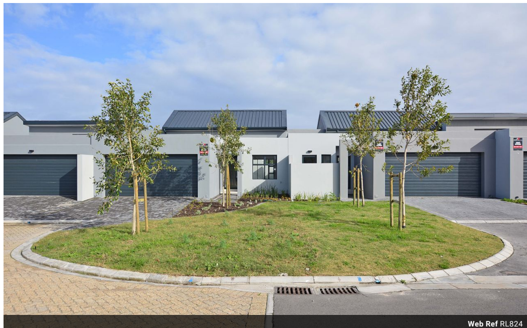
Web Ref RL824

Aska House, Newlands on Main, 1st Floor, Piazza Level, Main Rd, Newlands